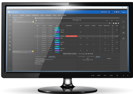
Figure 2. Deep Analyzer Tool within Enduro