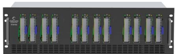
Front View of the 12-Bay U.2 Enclosure

The E-Series 12-Bay U.2 Enclosures provide a simple, flexible way to test several mixed-protocol SSDs when connected to an OakGate expandable desktop or 3U rackmount appliance. This 3U rackmount enclosure allows testing of up to twelve SSDs that use a U.2 (SFF-8639) connector. The OakGate Storage Validation Framework (SVF) software, supplied with the appliance, can exercise each SSD individually, as well as provide built-in power cycling and power measurement capabilities.