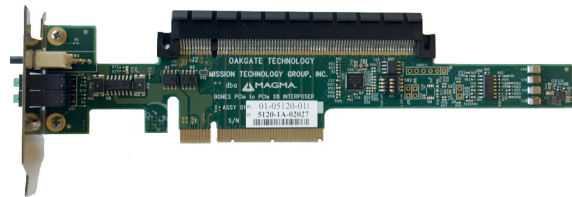
Figure 1. PCIe Power Interposer Card for OakGate Appliances and 7-Slot PCIe Enclosure (OGT-AP100)

The A-Series PCIe Power Interposer Card for OakGate Appliances and 7-Slot PCIe Enclosure (OGT-AP100) provides power control and measurement for an attached PCIe device. The device is typically a PCIe edge card. With the proper adapter (SFF-8639 adapter), other types of PCIe devices can be attached as well. The OGT-AP100 resides in a PCIe backplane slot of a supported OakGate appliance or enclosure, as shown in Figure 2.